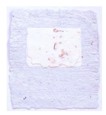
Handmade Paper Deb Slusser