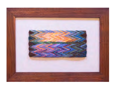
Conesus Lake Sunrise 1 Trish Jones