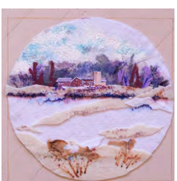
Winter View from Clay Street Carl Shanahan