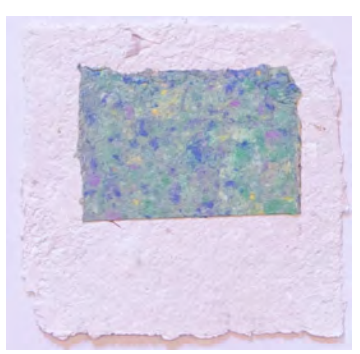
Handmade Paper Deb Slusser