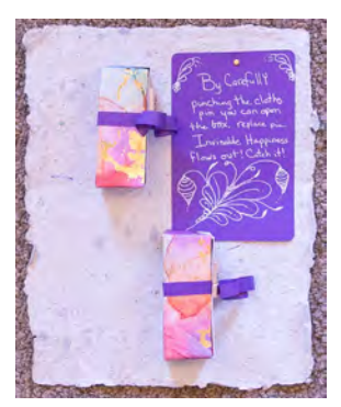
Paper with Boxes Deb Slusser