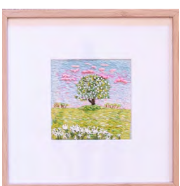
That Tree on Reservoir Road - Spring Rose Sherwood