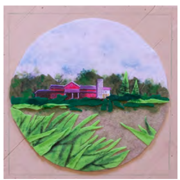
Spring View from Clay Street Carl Shanahan