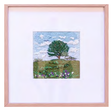
That Tree on Reservoir Road - Summer Rose Sherwood