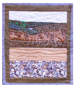
A Soil Profile Pat LaPoint