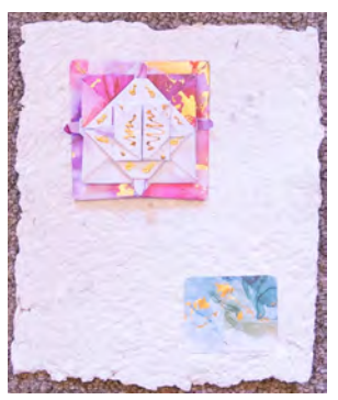
Paper with Expanding Box Deb Slusser