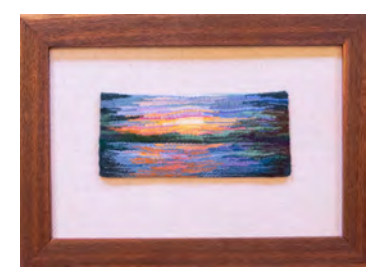
Conesus Lake Sunrise 2 Trish Jones