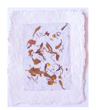
Handmade Paper Deb Slusser