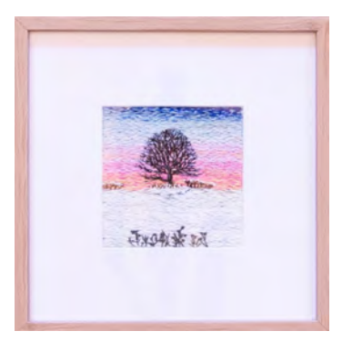
That Tree on Reservoir Road - Winter Rose Sherwood