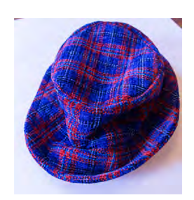
Blue/Red Brimmed Hat Loise E. Richens