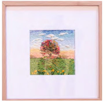
That Tree on Reservoir Road - Fall Rose Sherwood