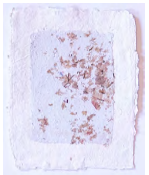
Handmade Paper Deb Slusser