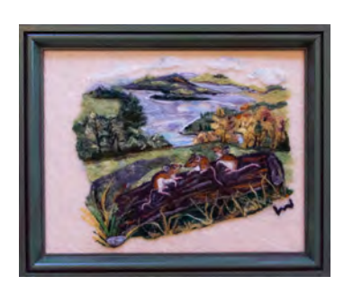
Scenic Seating for Three Lynn Wright