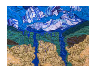
Quilted Map of Genesee Valley Rebeka Fergusson-Lutz