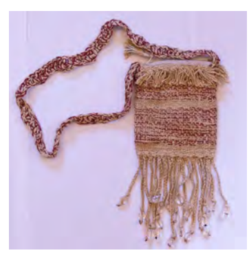
For Shopping Locally! Deb Slusser