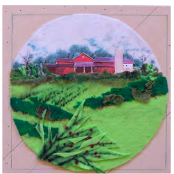
Summer View from Clay Street Carl Shanahan