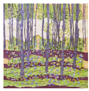
Bluebell Walk 2021 Tivesse