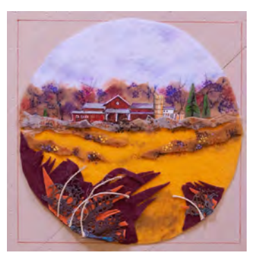
Autumn View from Clay Street Carl Shanahan