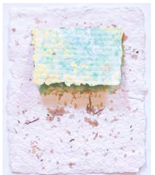
Handmade Paper Deb Slusser