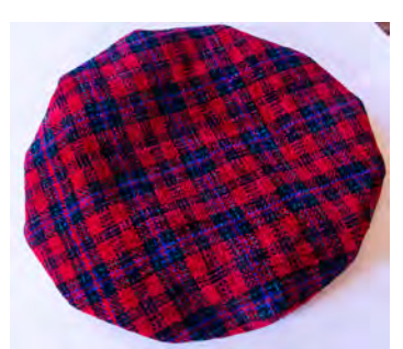
Red/Black Beret Loise E. Richens