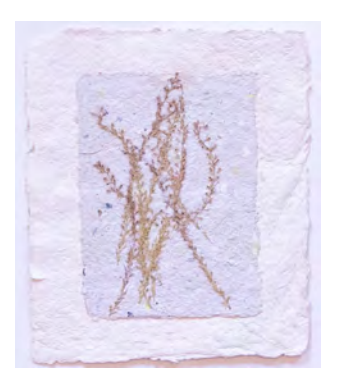
Handmade Paper Deb Slusser