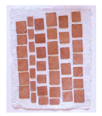
Handmade Paper Deb Slusser